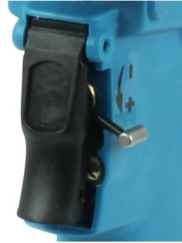
Simple vacuum extraction control