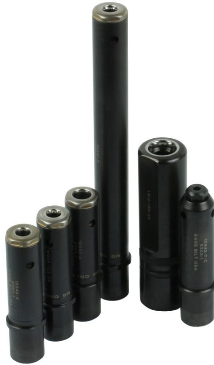
**Noses not included