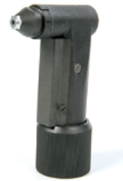
Right Angle Nose assembly for special clearance applications