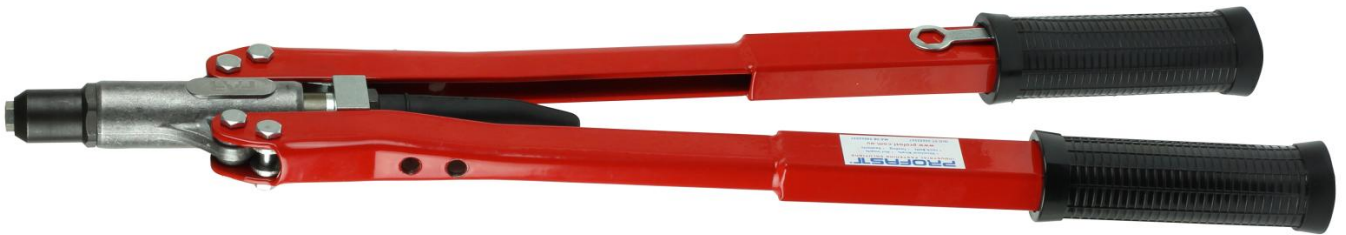
**K35F pictured above, K33F similar

This tool installs 3/16" & 1/4" Structural Rivets the extendable long arms provide the leverage required to set structural rivets quickly and easily.