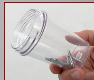
Sturdy transparent mandrel collector