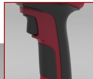
Brilliant ergonomics, low weight, gummed grip