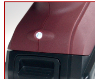
LED illuminated working area