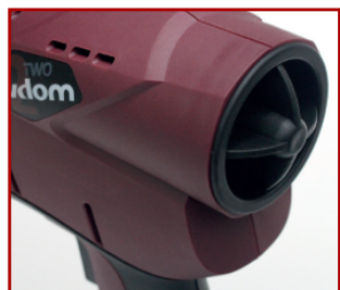
With cover cap for working without mandrel collector. Integrated mandrel holder in accordance with Health and Safety