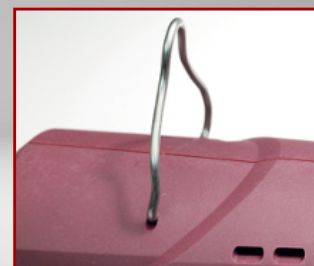
With attachment hook for balancer