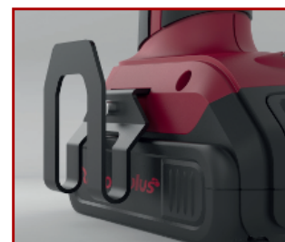
Practical belt clip